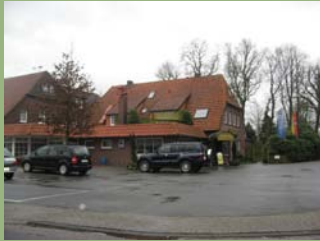
Harlan's motel in Danikhorst, Germany