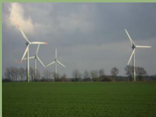
Modern windmills on the farm fields close to Bad Dithmarschen.