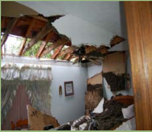
The roof was gone and trees down everywhere