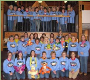
The women's group poses for their photo

program for adults. We have touched many lives through these two programs.