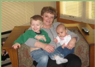
Oma and the grandkids