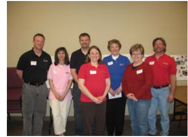
Divorce Care Staff

Another program called Divorce Care for Kids was started for kids who are struggling with their parent's divorce. This is offered in conjunction with our Divorce Care