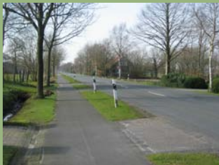
Tree lined street in Firrel,